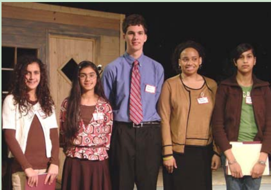
NEF awarded savings bonds to student contest winners at the Unity in the Community event.