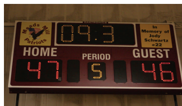
A furious finish wasn't enough as the teachers missed their last three shots in the closing seconds.

Tripp on a banked shot, but then the students exploded to a fourteen point lead by the end of the first quarter.